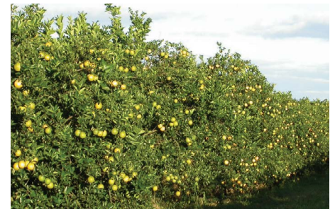
Improved fruit set