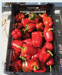
YaraTera SUPER FK 30%