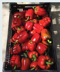
Control (without YaraTera SUPER FK)