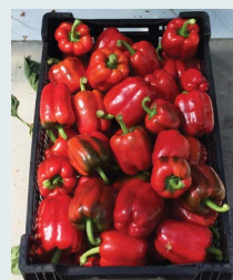
YaraTera SUPER FK 50%